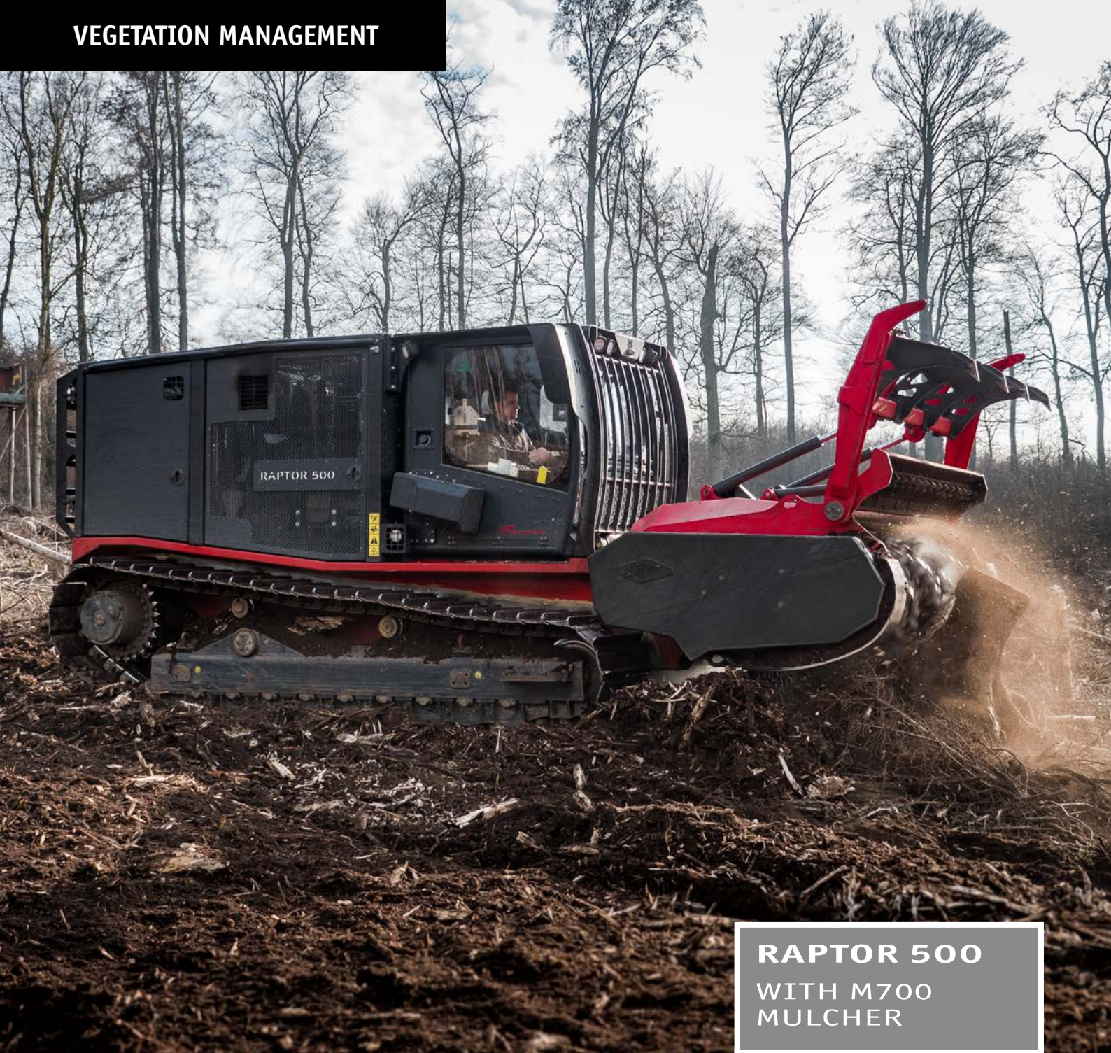
RAPTOR 500 WITH M700 MULCHER